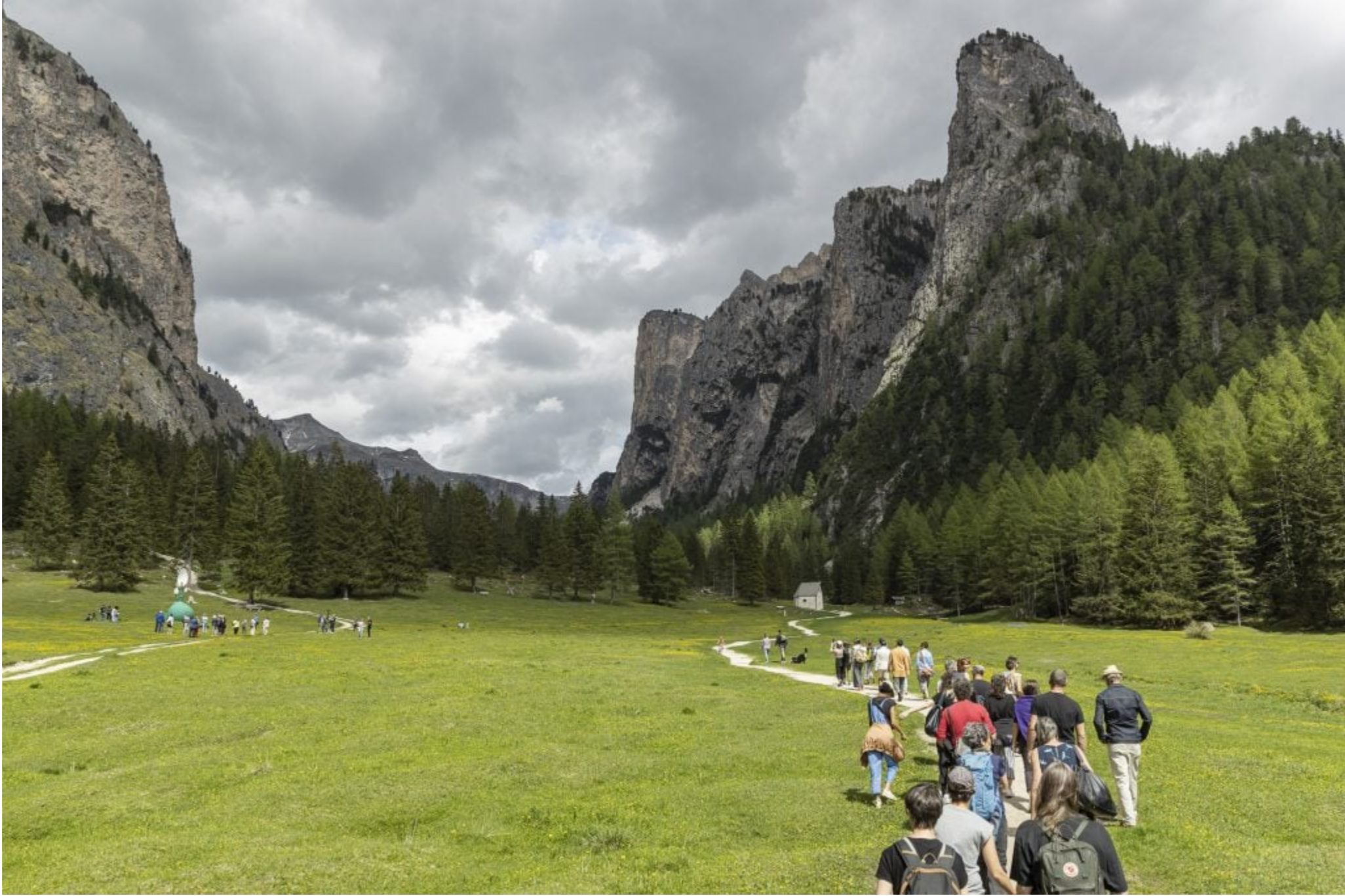
A view from the opening of the Gherdëina Biennale, 2022. View of Vallunga, Selva Gardena.

The Gherdëina Biennale takes full advantage of the ethereal landscape of the UNESCO World Heritage site.