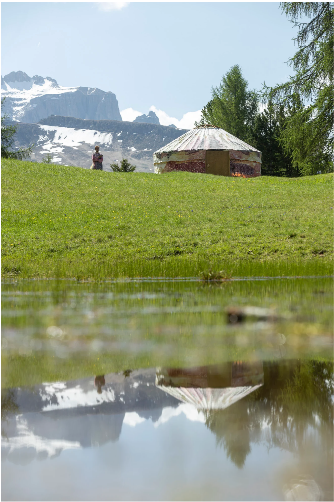
Alex Cecchetti, SENTIERO (2022).

Upon reaching the top of the mountain, visitors were offered soup and bread made with local ingredients, conveying a sense of gratitude towards the surrounding non-human species inhabiting the mountains.