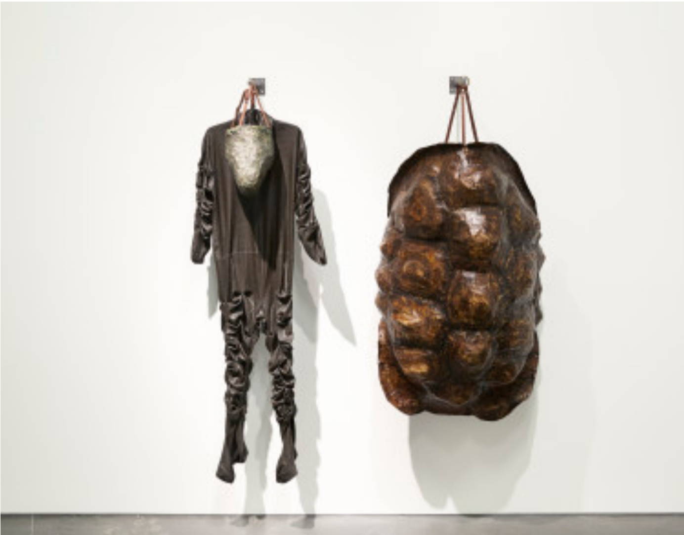
Argentinian artist Eduardo Navarro. Timeless Alex , 2015. Performance and sculpture. Duration variable. Sculpture Variables dimensions.

| ( /#facebook ) ( /#twitter ) ( /#google ) ( /#pinterest )